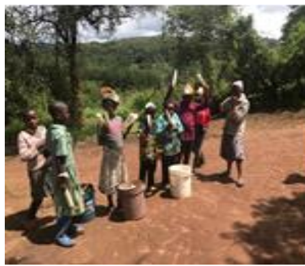
Children help with the maize harvest