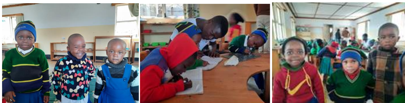
Our Kindergartners work hard and play hard