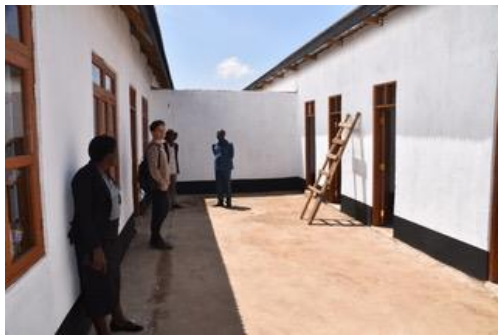
Courtyard of semi-attached houses