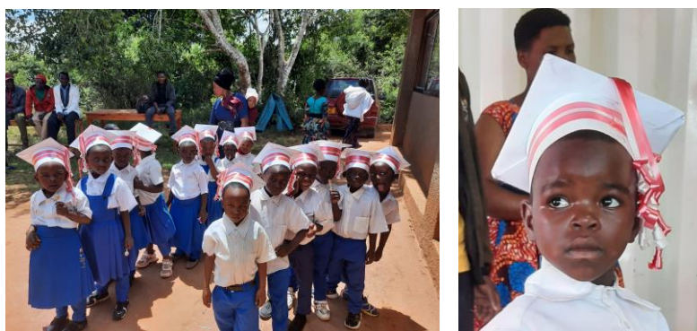
Graduation, December 2022