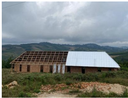
Roof going up!