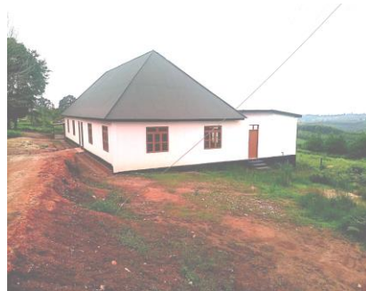
Two staff houses for doctors and nurses