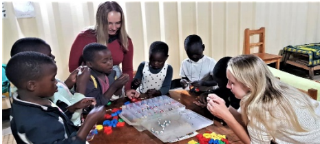
Making bead Necklaces