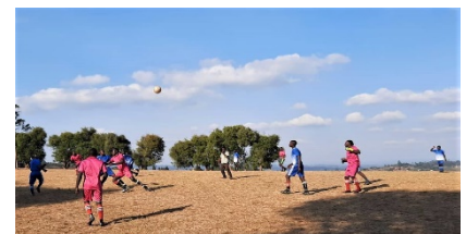
Inter Village Football Match