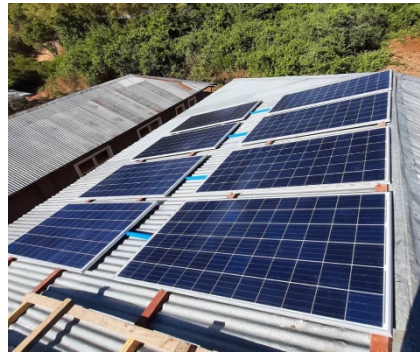
Completed Solar Panels on ICV Office Roof