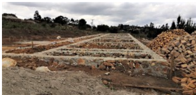
Igoda Clinic Extension Foundations

Igoda Clinic Extension: The foundations are down now, and the brickwork has been started, there was a delay due to a very wet season! This will provide the Igoda Clinic with more facilities, including a doctors and nurses accommodation to expand the facility to a wider catchment area (the nearest hospital being difficult to reach with the road structure as it is). This is being sponsored by a very generous donor from Belgium.