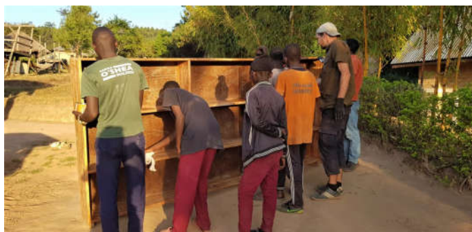
Preparing to paint the flags