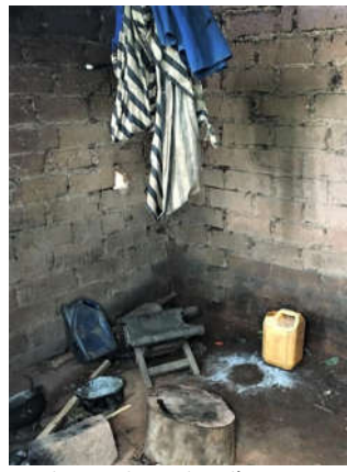
The Neglected Girl's House