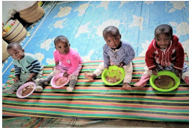
...four happy babies tucking in...

*Lishe is a very nourishing thick drink made from ground maize, millet, peanuts, sometimes soya beans, sugar and water, boiled.