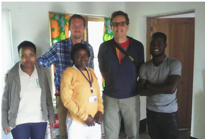
PSI Staff pose with FCWCT Administration team!

A new partnership is allowing women from Mufindi to receive discreet, safe long-term reproductive health care!