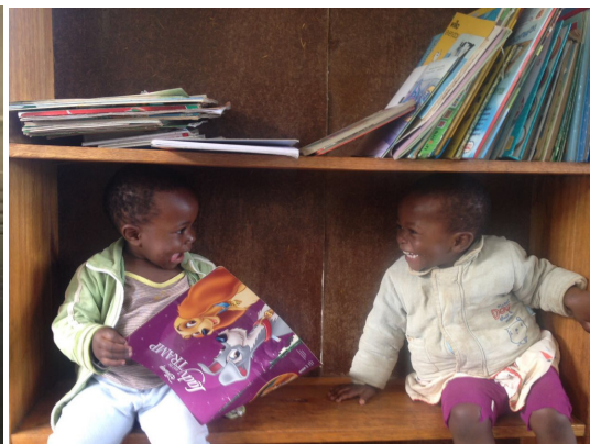
Top: An adorable moment in the Nursery school. Looks like reading time!