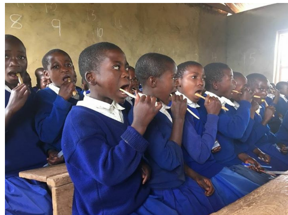
Screenings were done at 8 primary schools in the project area.